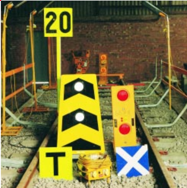
12-002 · 12-003 · 12-004